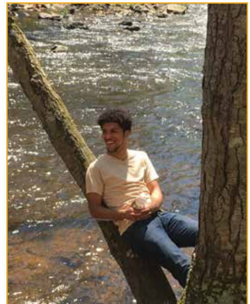
M-P.A.C.T. students experience nature and time away from school and the rigors of their lives during this field trip to Hacklebarney State Park in Long Valley, NJ