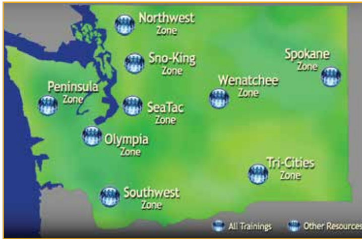
Through the Washington Education Association's Professional Development Network, members use this online map to search among nine zones to find the professional development trainings offered in their part of state.

The results of a 2013 PreK-12 professional development survey of Washington Education Association (WEA) members were not only revealing, but they sparked an Association-led transformation. It began when 7,500 members across Washington State responded and leaders listened and acted on what they had to say.