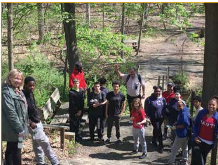
Woodbridge teachers and educators are helping these M-P.A.C.T. students to cultivate healthy lifestyles.