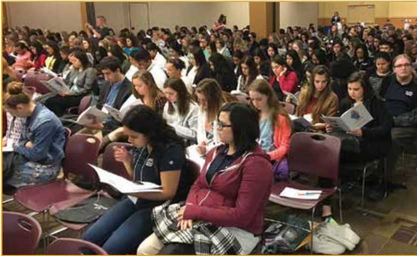
High school students packed this University of Nebraska auditorium. They are members of Educators Rising, a national high school club for future teachers.

In the state of Nebraska, racial and ethnic populations make up about 47 percent of all public school students, but only four percent of the teachers are from diverse racial and ethnic backgrounds. Here is how those numbers play out in Omaha, home to the state's largest school district—more than 70 percent of the students are nonwhite. By contrast, nearly 89 percent of the district's public school teachers are white.