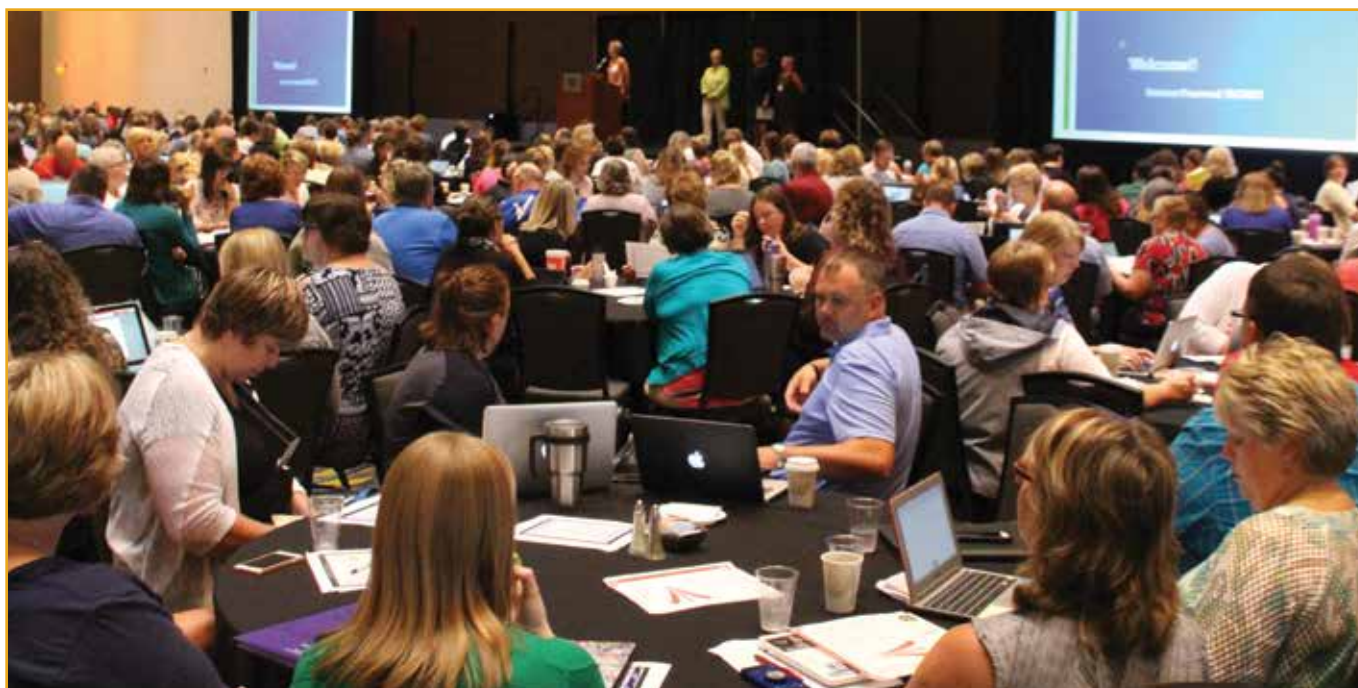
July 2017 Leveraging Teacher Leadership: An Institute for Teacher Leaders and Administrators

ISEA members believed that students would learn more in a school environment where teachers and other educators were empowered to help each other grow in their practices. ISEA’s GPS Fund grant for the Teacher Leadership Institute was the vehicle through which educators gained skills and knowledge—and learned to lead.